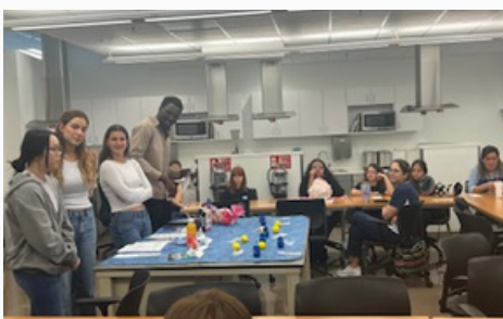
"Sugar Shock" activity for all children from Stempel College as part of the Bring Your Child to Work Day at FIU.