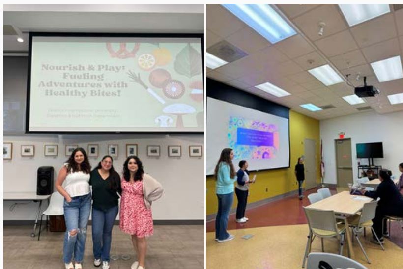
Literary Bites: Educating the community on how to create healthy eating habits.