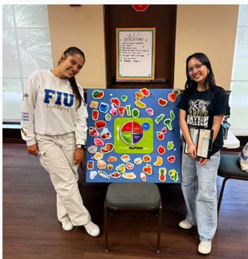
Baptist Health: Educating the future generations on the MyPlate guidelines with interactive activities.