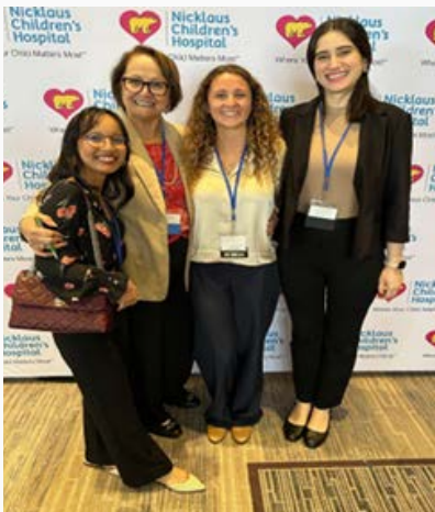
Nicklaus Children's Hospital Symposium: Helped event organizers set up the venue for the annual symposium.