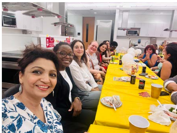
Celebrating our Ph.D. students with a potluck.