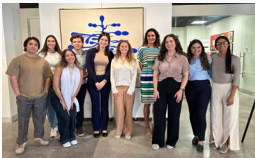
Mexican Consulate: Assisting the Mexican community to create lifelong healthy habits by encouraging them to make informed food choices and achieve sustainable health improvements.