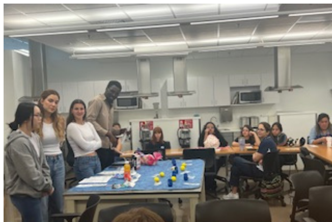
Our students prepared the “Sugar Shock” activity for all children from Stempel College.