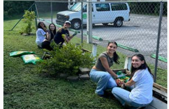
Community Garden: Giving back to the community and facilitating learning opportunities for students at the WOW Center.