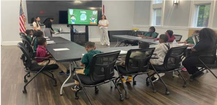
Chapman Partnership: Teaching nutrition education to children and low-income adults who are on the path to becoming self-sufficient.