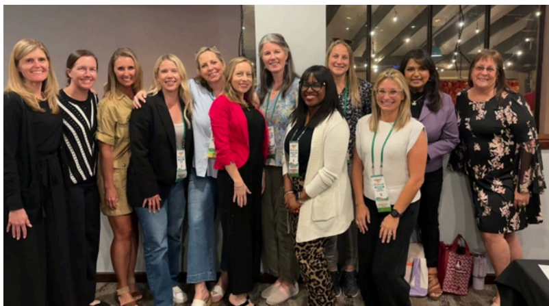
Faculty, staff and students attended and presented at this year’s FANS conference