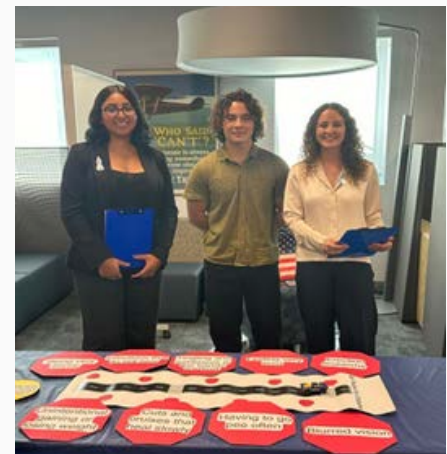
Diabetes Awareness Day: Raising awareness about diabetes, one of the chronic illnesses that affects thousands of Americans.