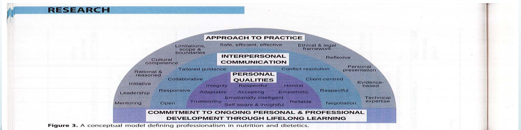
Figure 3. A conceptual model defining professionalism in nutrition and dietetics.