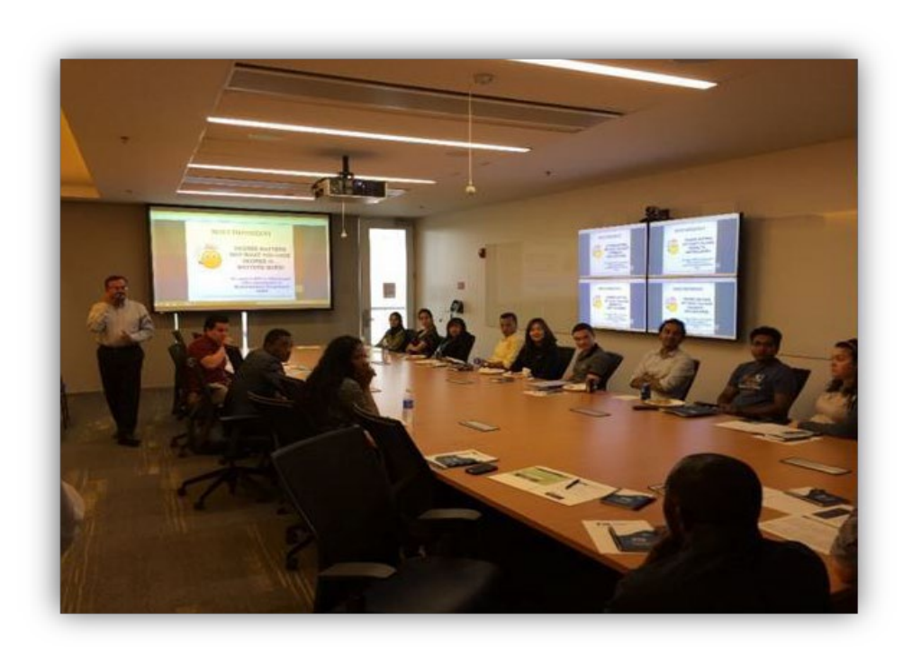
(Above.) Q&A session for EHS students and prospective students.

EHSA Website: https://fiu.campuslabs.com/engage/organization/environmental-health-graduate-student-association