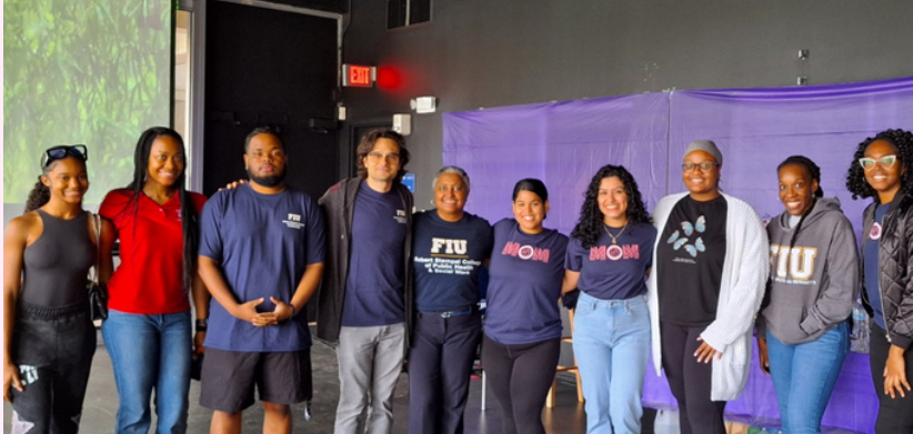
Stempel College Social Work and Public Health Students & Faculty